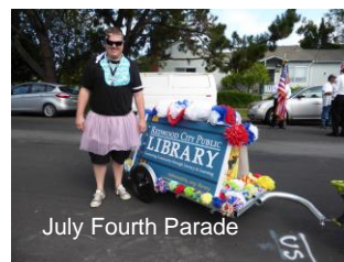
July Fourth Parade