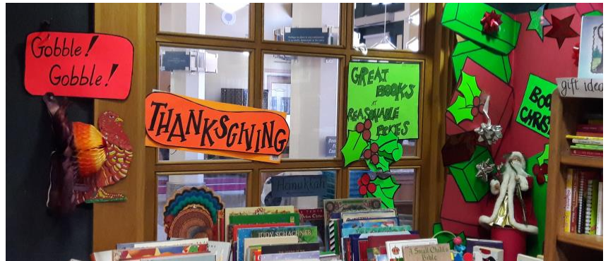
Holiday Sale in the Bookstore ~Lobby of the Downtown Library~

To learn more and register, visit: http://www.redwoodcity.org/departments/library/get-it-online/discover-go